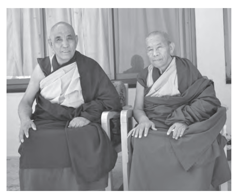
With Jangtse Choje Lobsang Tenzin Rinpoche